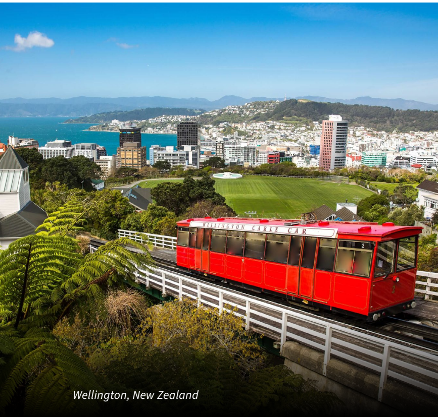
Wellington, New Zealand