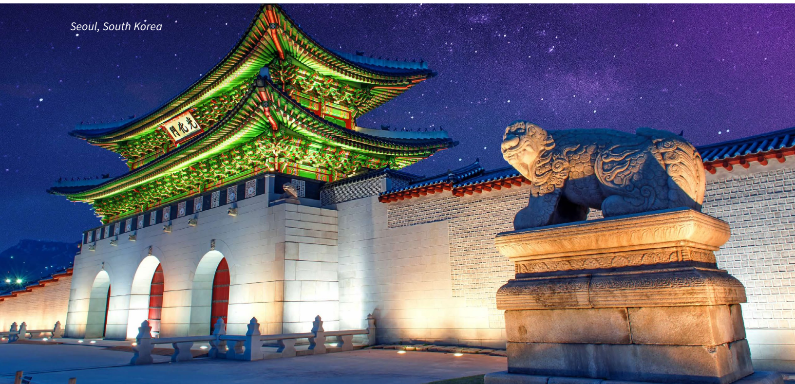
Seoul, South Korea