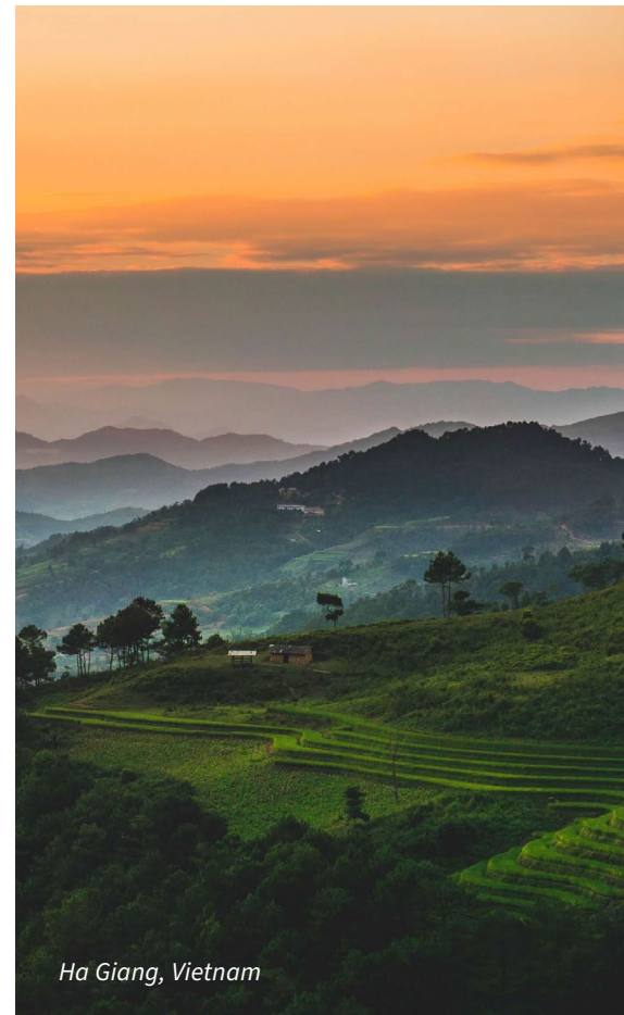
Ha Giang, Vietnam